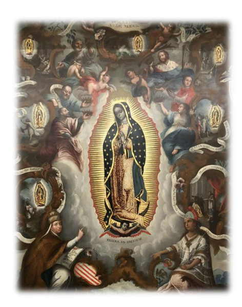
Let's pray all for all