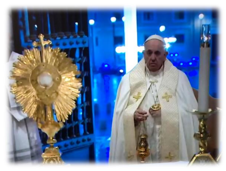
Vatican City, March 27, 2020.- Meditation of Pope Francis in Urbi et Orbi blessing, St. Peter's Square empty to ask for the end of the coronavirus or COVID19 epidemic

"At dusk" (Mk 4.35). Thus begins the Gospel that we have heard. For a few weeks now it seems that everything has darkened. Dense darkness has covered our squares, streets and cities; they took over our lives, filling everything with a deafening silence and a desolate emptiness that paralyzes everything in its path: it palpitates in the air, it feels in the gestures, the eyes say it.