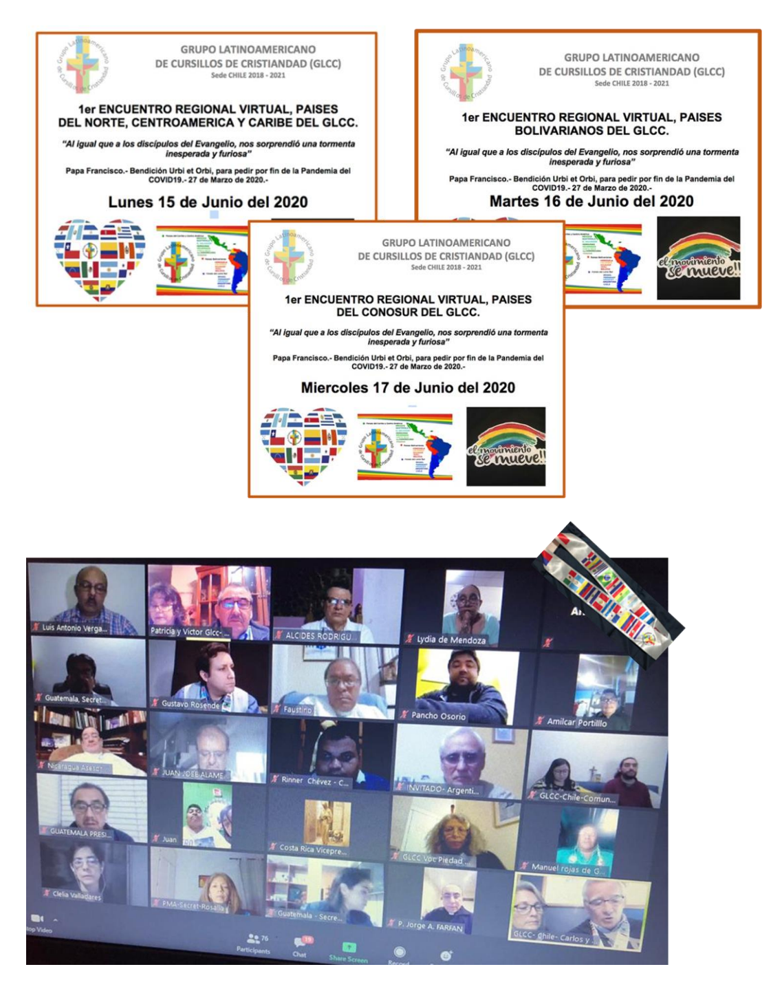
Close in the distance, connected by technology to communicate Christ.