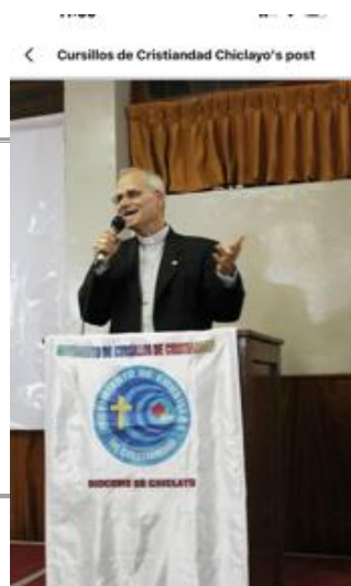
Monseñor Robert participando en la Escuela de Formación del MCC Chiclayo.

I recently received this photo. Is our Pope Leo XIV a Cursillista?