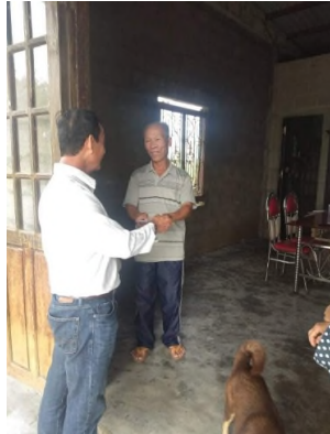
A little Christmas present