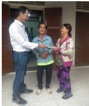
Support each other