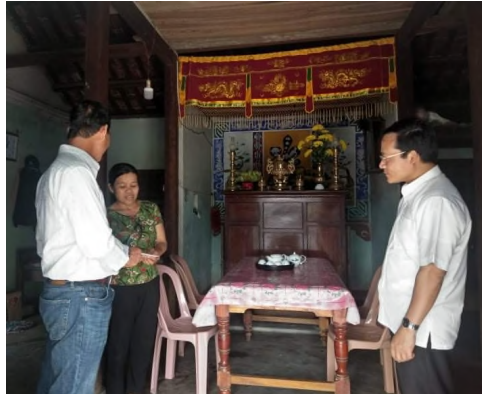
Another little present