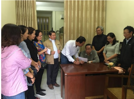
Visiting another retired priest