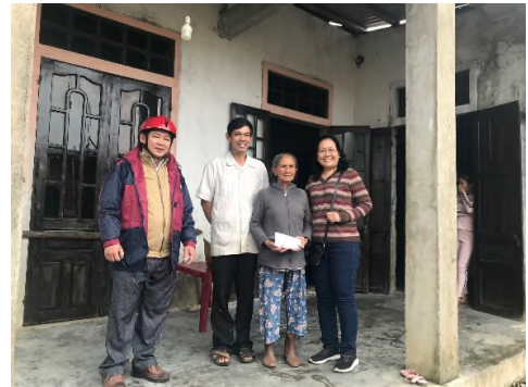
Two priests, but one wears two-colours sandals